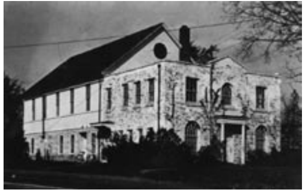
The Old Library at Route 66 and North Main Street (c.1935)