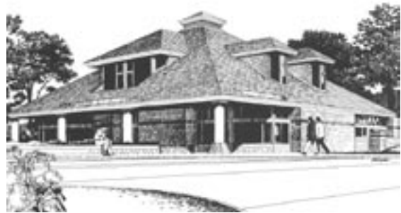
Architect’s rendering for 1987’s new construction.

Remember Libby? She was the logo mascot for the 1987 building campaign.