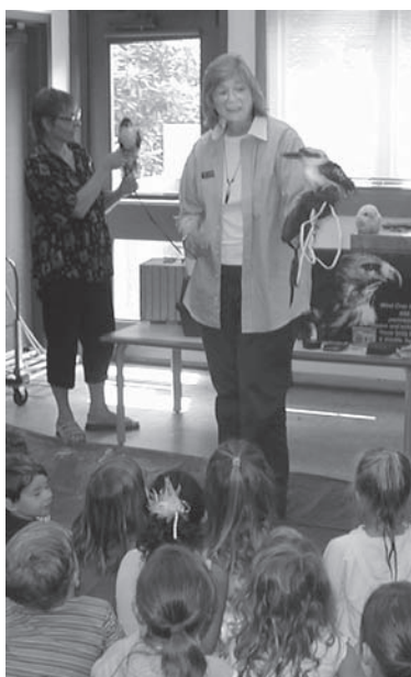
Wind Over Wings and their feathered friends