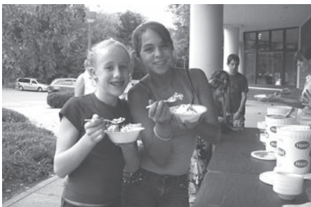
Ice cream girls socializing

Our activities could not be accomplished without your help and support. Many thanks.